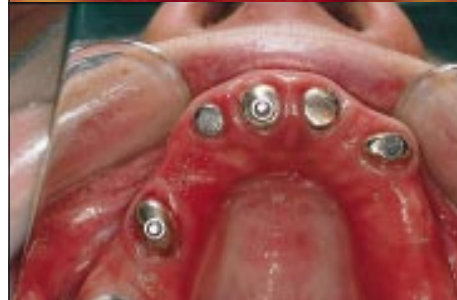
Overdenture (top) supported by metal studs inserted into natural tooth roots (bottom)