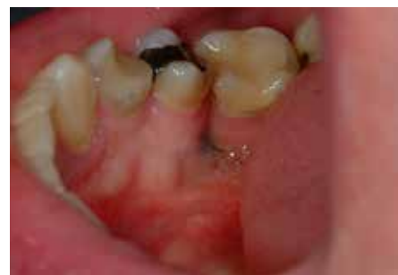
Figure 1. Torus mandibularis.