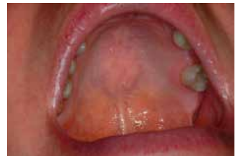
Figure 2. Torus palatinus.