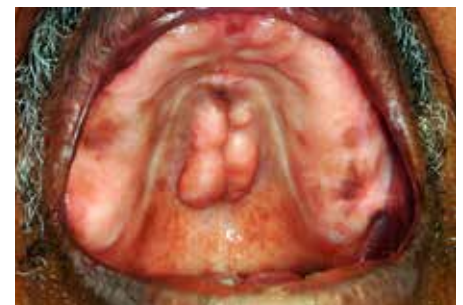
Figure 3. Torus palatinus.