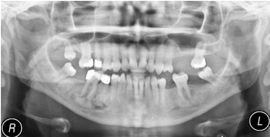
Figure 4. Osseous dysplasia florid type. DPT showing multiple periapical radiolucencies with central opacities of similar density to bone/cementum. Teeth vital.

proliferating fibrous stroma which forms varying amounts of woven bone spicules and cementum-like material (Table 2).