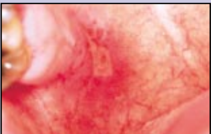
Figure 6. Angina bullosa haemorrhagica.