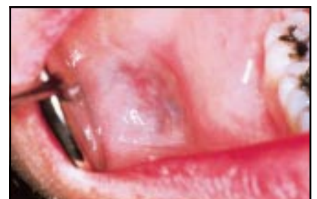
Figure 7. Haemangioma.