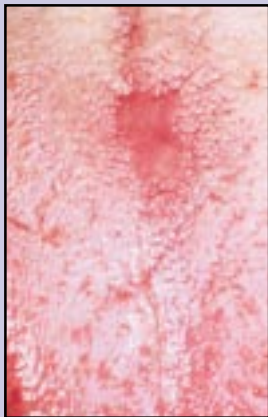
Figure 2. Candidosis; median rhomboid glossitis.