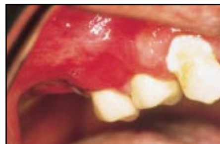
Figure 1. Erythroplasia.

Mucositis is common after irradiation of tumours of the head and neck, if the radiation field involves the oral mucosa. Arising within 3 weeks of the irradiation,