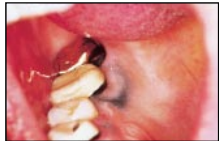
Figure 9. Amalgam tattoo.