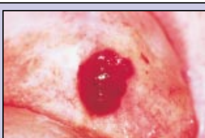
Figure 5. Angina bullosa haemorrhagica.

Addison's disease (adrenocortical hypofunction; Table 5) is a rare disease, seen typically in young or middle-aged women, due to damage to the adrenal cortex. It results in hypotension and a feedback pituitary overproduction of adrenocorticotrophic hormone (ACTH)