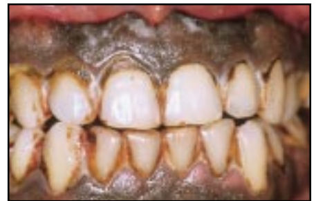
Figure 8. Racial pigmentation.