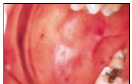
Figure 4. Purpura.

There is no specific treatment other than reassurance. The blisters should be carefully burst. Topical analgesics may provide symptomatic relief.