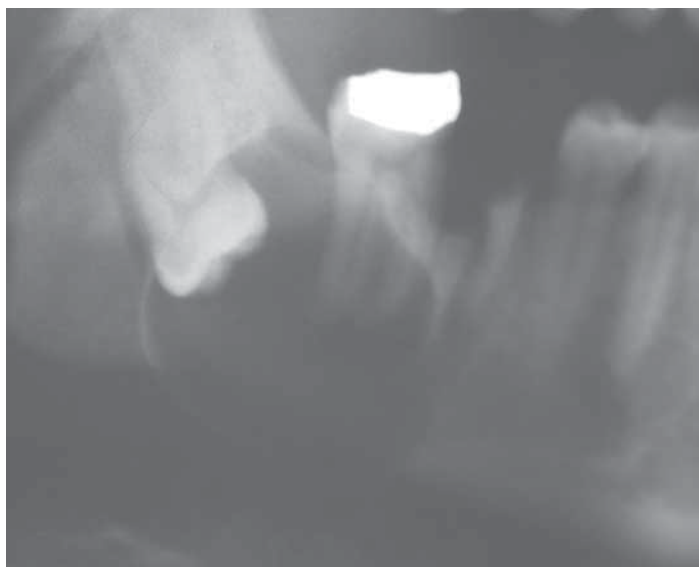
Figure 1. Diagnostic radiograph showing unilocular cystic lesion associated with ectopic lower third molar.