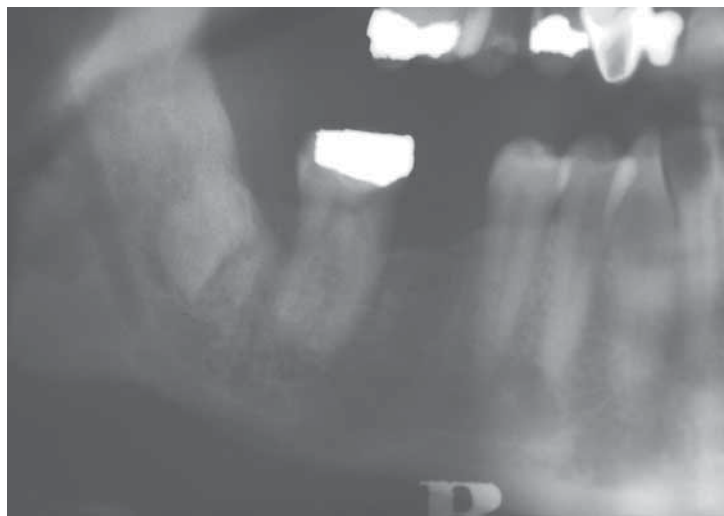
Figure 4. Further post-operative radiograph at 33 months demonstrating further favourable migration of the roots of the lower third molar with signs of partial obliteration residual pulp chamber.

However, complete removal of the ectopic tooth was considered to carry a moderate to high risk of inferior dental nerve damage. An elective coronectomy was therefore planned with complete enucleation of the cyst lining. The aim was to reduce the risk of inferior dental nerve damage, either through direct trauma or indirectly as a result of iatrogenic or post-operative mandibular fracture. A relatively common result of coronectomy was noted in the follow-up and this was migration of retained roots at an estimated rate of 0.2mm per month over a 33-month period. Radiographic signs of progressive pulp chamber obliteration were also observed. Although the root fragments were in a more favourable position for surgical removal, a second procedure has so far not been required.