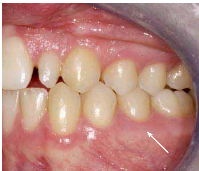
Figure 2. CT scan of the left hemi-mandible showing lytic changes in the cortical bone (white arrow).