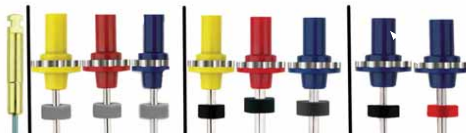
Figure 1. OPG showing an ill-defined radiolucency associated with the left mandibular ramus and an impacted lower left third molar (white arrow).

At our outpatient clinic, she presented with a left masseteric swelling, trismus and pus draining from her lower