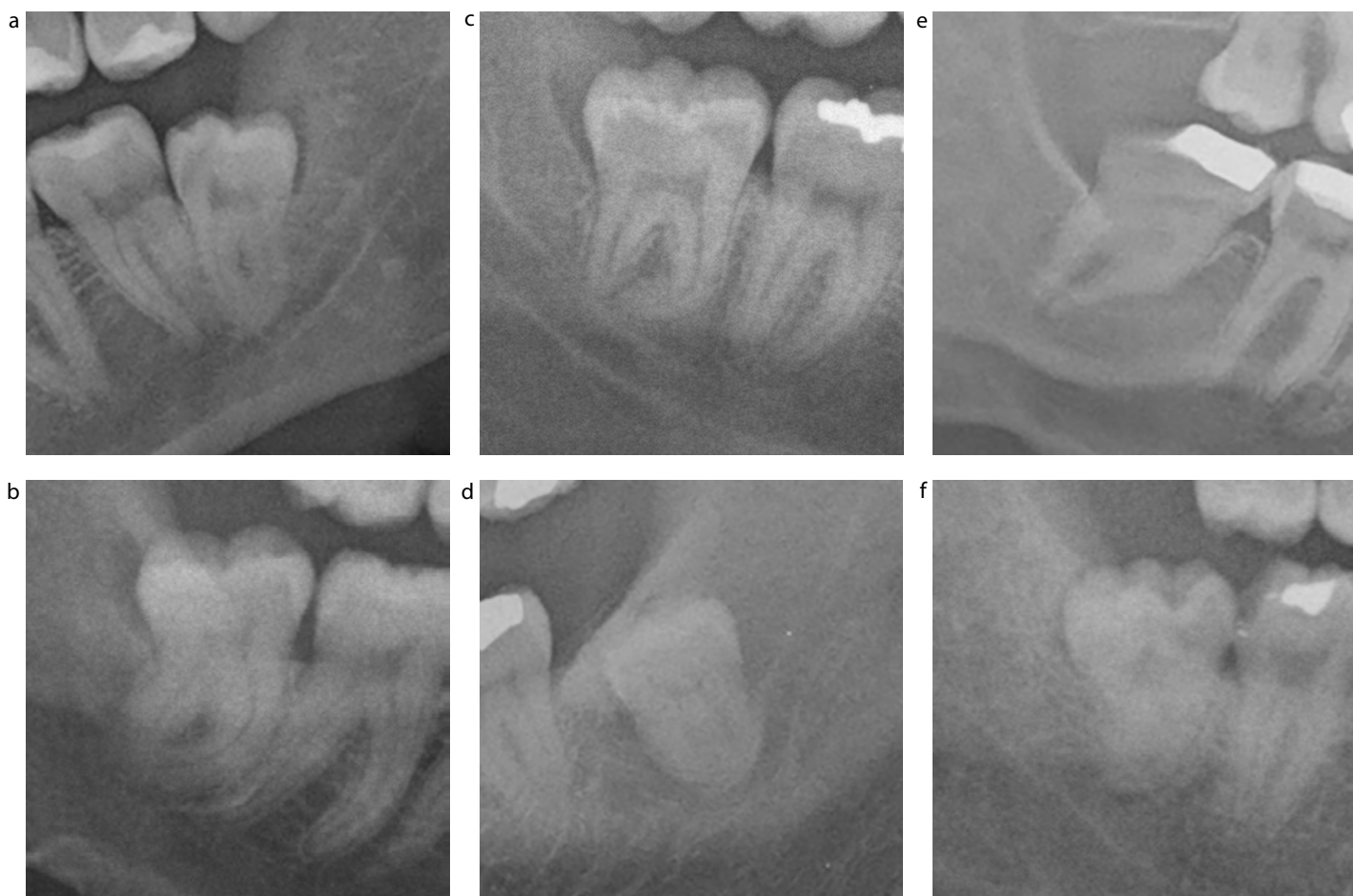
Figure 1. Radiographic warning signs on OPT. (a) Interruption of the white lines. (b) Darkening of the root. (c) Deflected root. (d) Diversion of the inferior alveolar canal. (e) Narrowing of the root. (f) Juxta-apical area.

Incidence of dry socket varies greatly between studies. A 2014 systematic review shows a median incidence of 2.9% when using a triangular flap or 10% with an envelope flap. 6 Treponema denticola and other spirochetes are sometimes implicated in the condition and have been shown to