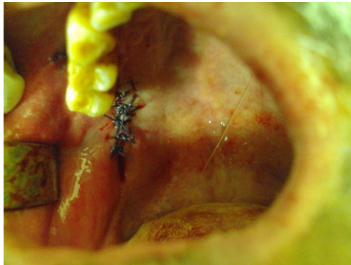
Figure 5. Final aspect of the fistula closing

used to close oroantral fistula and oroantral communication. Its success has been proved in the medical literature. It interferes little with vestibular depth. The buccal advancement flap interferes more with vestibular depth and cannot be used for larger oroantral fistula. The palatal flaps caused more discomfort, for the patient, than buccal pad of fat. The artificial material placement leads to exposure of the implanted material and infection and removal of implant is essential.