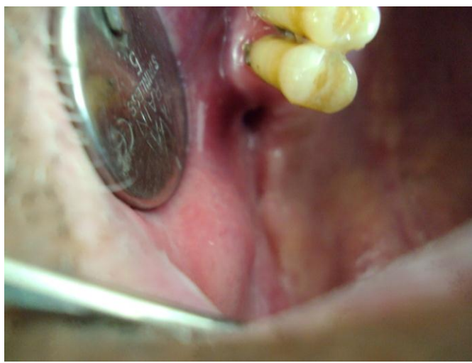
Figure 1. Oroantral fistula