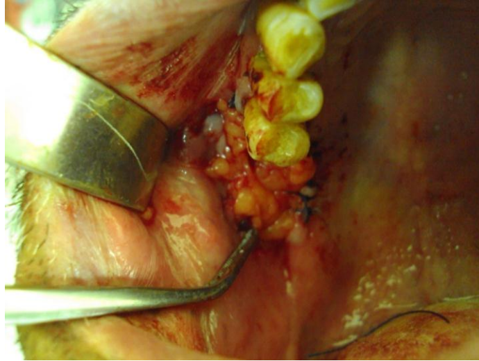
Figure 4. Initial suture