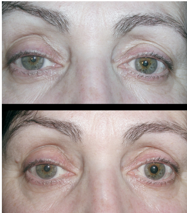
FIGURE 2. Anisocoria increased in darkness (inferior image), resulting in presumed diagnosis of iatrogenic Horner syndrome.

Iatrogenic Horner syndrome, probably one of the most frequent variants of this classic entity, has been reported after a very wide range of surgeries and invasive head and neck procedures. It has been described after subclavian/jugular venous puncture, 1,2 chest tube thoracostomy, 2,3 internal jugular vein can-