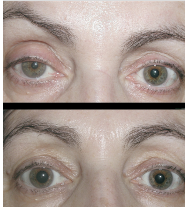
FIGURE 3. Apraclonidine test (inferior image) confirmed suspected diagnosis of Horner syndrome.