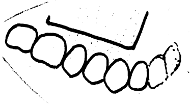
Fig. 3. Experimental design.

but very little, if any, scarring was evident with this incision (Fig. 2a)