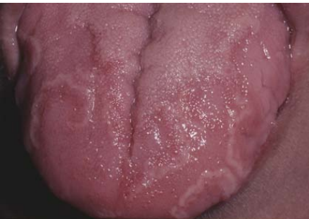
Figure 3 – This patient has several characteristic patches of geographic tongue that have developed on the top surface and sides of her tongue.