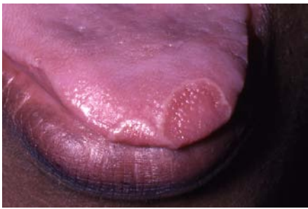
Figure 1 – This picture shows typical red areas with white borders on the tip of this patient's tongue.