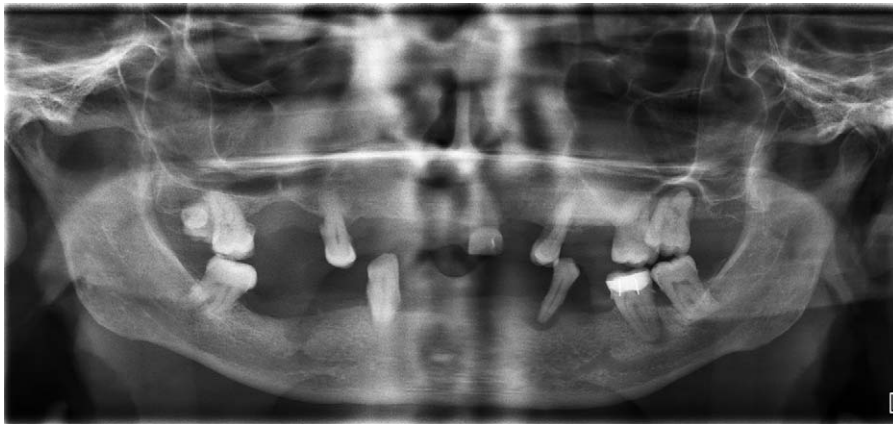
Fig. 3. Orthopantomogram showing apical periodontitis associated with dentition in the left maxillary and mandibular quadrants.