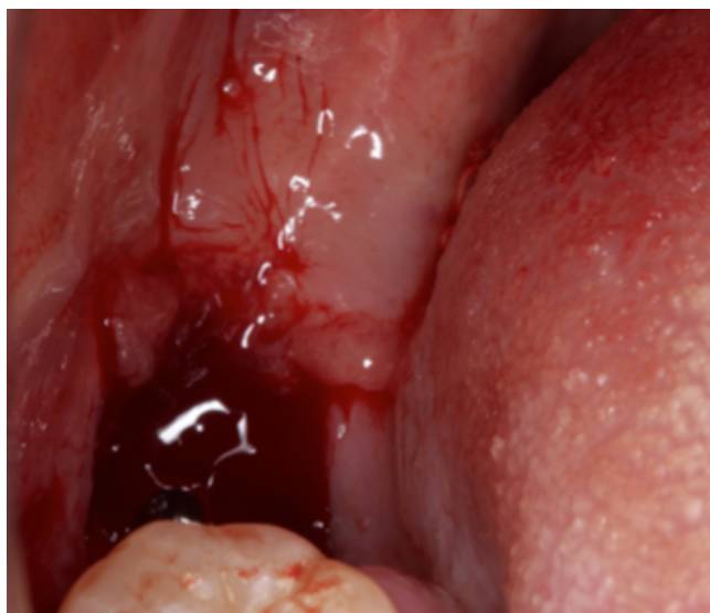
Fig 2 Generalised “ooze” from a lower wisdom tooth socket