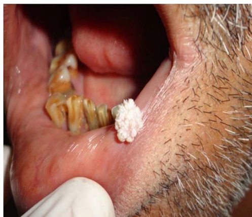
Figure 1 Photograph showing the lesion.

The presence of virus can be confirmed by PCR and by in situ hybridisation using radioisotope-labelled specific probes. However, hybridisation is