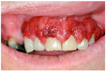
Figure 7. Polyangiitis with granulomatosis (formerly termed Wegener granulomatosis) – pathognomonic appearance of 'strawberry gingivitis'.

A GP or an NHS hospital doctor may help the patient to complete the form but is entitled to charge for this service. In the case of a claim for treatment under private