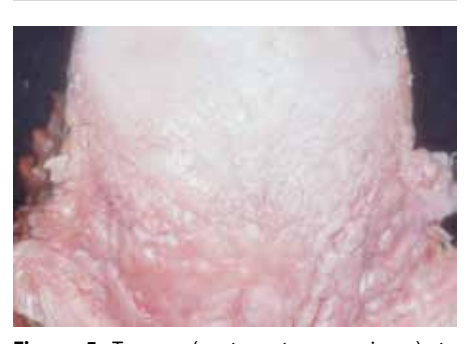
Figure 5 . Tongue (post-mortem specimen), to show the vallate papillae and posterior third topographical anatomy which is difficult to visualize fully without endoscopy or examination under anaesthesia.