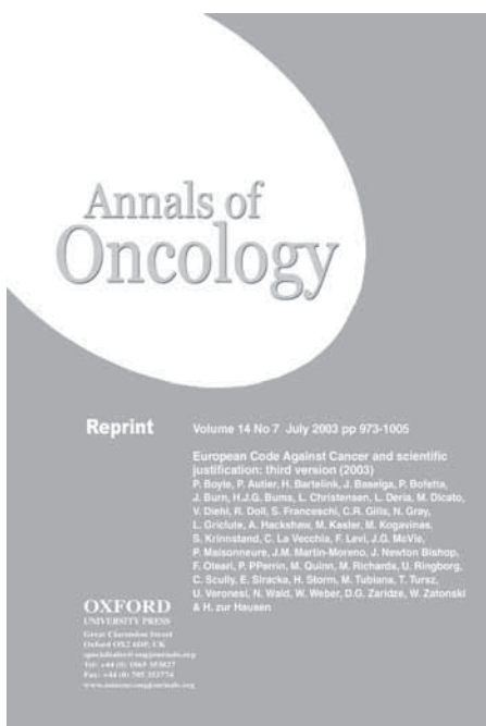
Figure 3. The European Code against Cancer (2003).