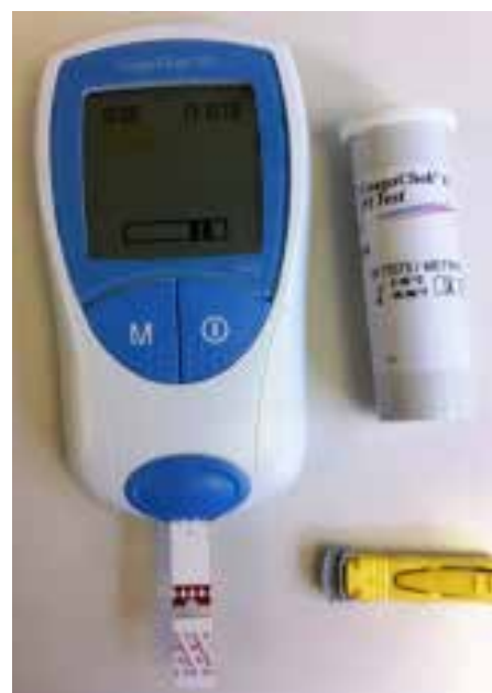
Figure 4. Portable INR testing machine.

CYP450 enzyme inducers – decrease Warfarin action; decrease INR (S-C-R-A-P):