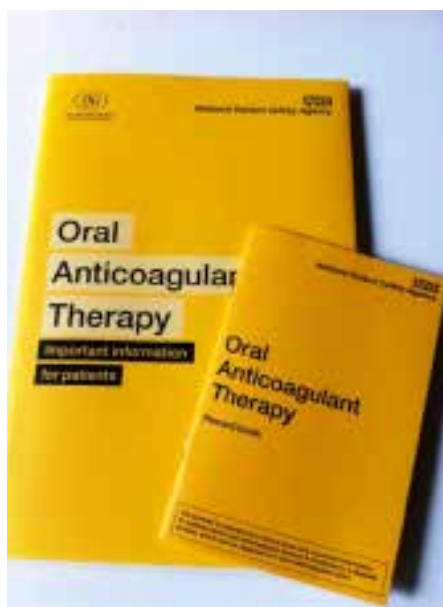
Figure 3. Yellow INR record book with patient advice leaflet.

BSCCH guidelines 7 on warfarin and the North West medicines information centre guidance on antiplatelet medication 5 both advocate the use of local haemostatic