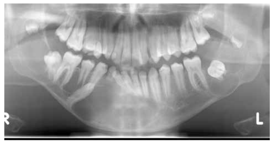
Figure 9. Multiple keratocystic odontogenic tumours associated with naevoid basal cell carcinoma syndrome.

radicular surgery of the associated tooth or extraction.