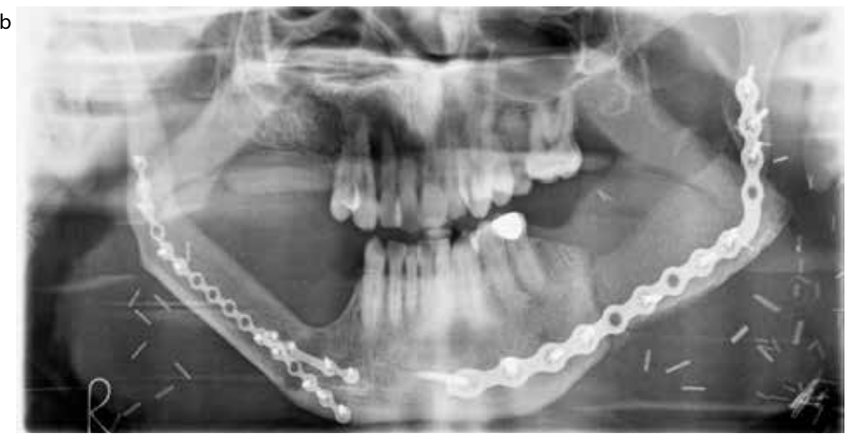
Figure 11. Bilateral keratocystic odontogenic tumours reconstruction. (a) Right-sided reconstruction with a fibula flap following resection of keratocystic odontogenic tumour and demonstrating a new left-sided lesion. (b) Left-sided reconstruction with a DCIA flap following resection of keratocystic odontogenic tumour.

is believed to be derived from the reduced enamel epithelium. However, eruption is impeded by soft tissue, rather than bone, particularly dense fibrous tissue.