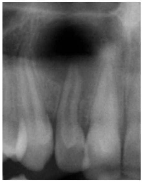
Figure 3. Radicular cyst associated with non-vital UR2 with dens evaginatus.