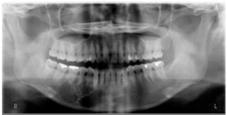
Figure 1. Ameloblastoma affecting right mandible.