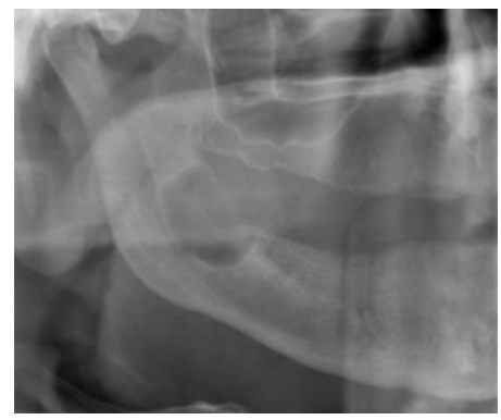
Figure 10. Unilocular keratocystic odontogenic tumour affecting the right angle of the mandible.

a thin, regular layer 2–5 cells thick of non-keratinized stratified squamous or flattened/low cuboidal epithelium which resembles the reduced enamel epithelium. The cyst contains proteinaceous, yellowish fluid and cholesterol crystals with a soluble protein content of 5–7 g/dl.