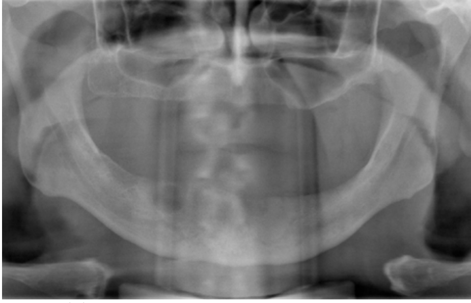
Figure 4. Residual cyst in LR5 region.

Classically, radicular cysts are round or ovoid radiolucencies with a radio-opaque margin extending from the lamina dura of the non-vital tooth. This margin, however, may not always be present in the case of infection or rapidly expanding cysts (Figure 3). Root resorption may be seen radiographically but the size of the lesion