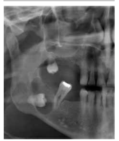
Figure 5. Dentigerous cyst associated with unerupted LR8.

there may be individuals who are prone to developing radicular cysts and this may explain why patients present with more than one.<sup>5</sup>