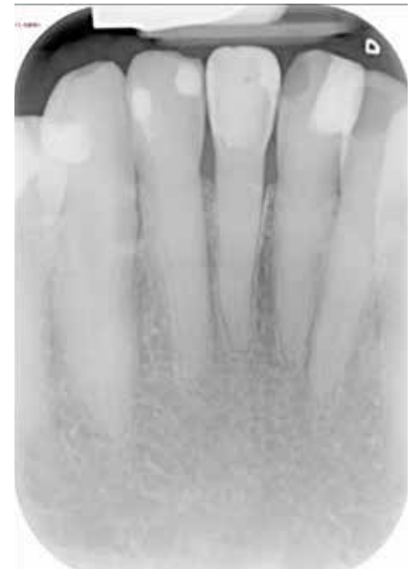
Figure 8. Radiographic appearance of lateral periodontal cyst between LR2 and LR3.

radiographically does not give an indication of whether the lesion is cystic in nature or an apical granuloma. Differentiating between apical granulomas and radicular cysts radiographically has proven challenging and inaccurate.<sup>6</sup>