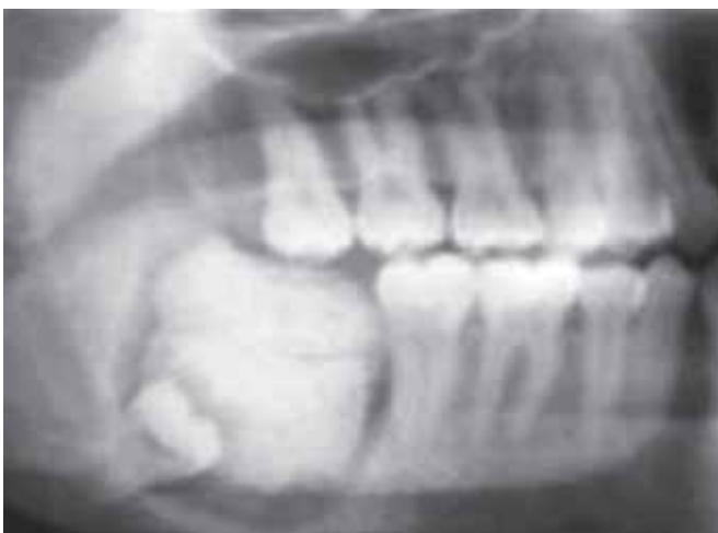
Fig. 3: Radiograph of complex odontome