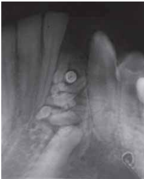
Fig. 2: Radiograph of compound odontome