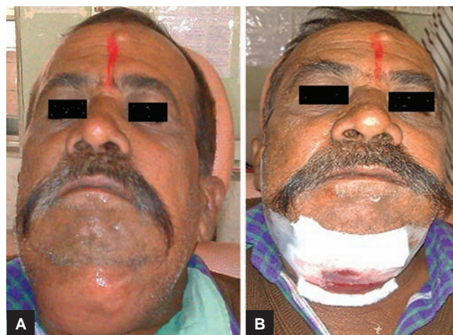
Figs 1A and B: Clinical images: (A) Pretreatment; and (B) posttreatment

Intraoral examination (Fig. 2A) revealed vestibular swelling and obliteration in the region of 35 (root stump) and 36 with pus discharge from gingival sulcus. Generalized attrition and gingival recession were noted. Orthopantomograph revealed (Fig. 2B) grossly destructed 46, 37, missing 26, and root stumps with 14, 18, 25, 35, 36. Depending on the history and clinical examination, a