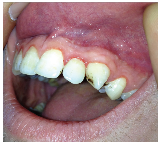
Figure 6: Intraoral photograph showing eruption of odontoma associated impacted canine tooth