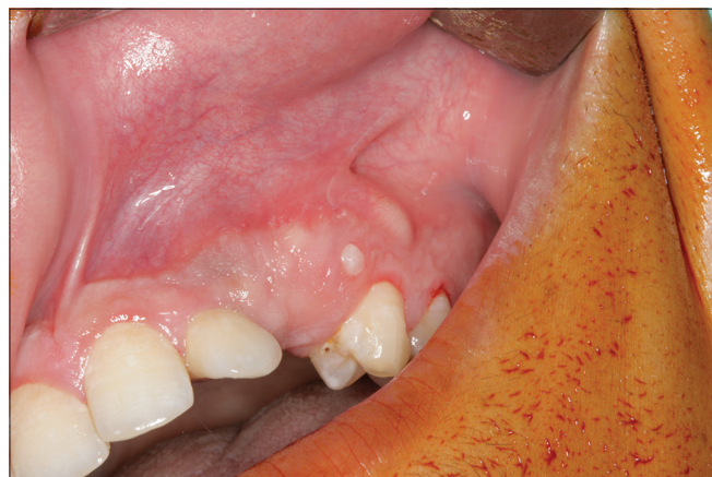
Figure 1: Intraoral view showing the eruption of compound odontoma

the left maxillary canine region. It was approximately 0.1 cm × 0.1 cm in diameter, showing a smooth surface. Surrounding mucosa was normal, and there were no signs of pain, infection, erythema or ulceration [Figure 1]. The panoramic and periapical radiographs showed