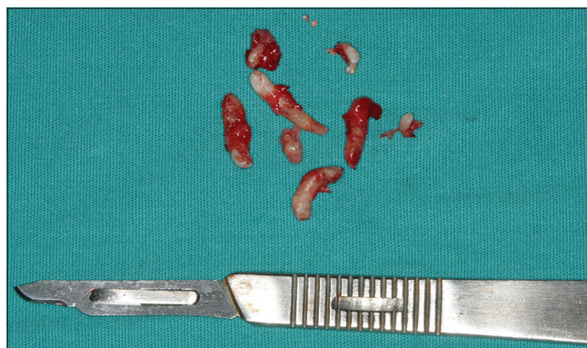
Figure 4: Excised multiple small tooth-like structures