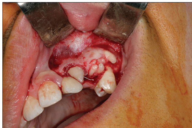
Figure 3: Intraoral view showing multiple small tooth-like structures