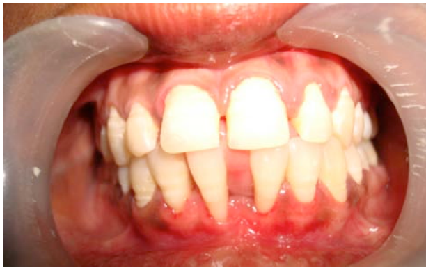
Fig. (8). Post-operative.