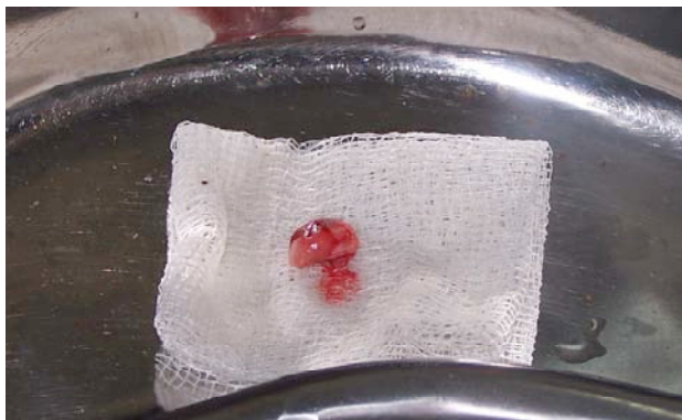
Fig. (10). Excised tissue.

The patient was recalled every month for a checkup. After 4 weeks there was no growth visible clinically. It was totally eliminated (Fig. 8). Supportive periodontal maintenance at 3 months was prescribed to maintain periodontal health and to re-evaluate this area. There was no recurrence even at the end of 6 months. At 1-yr recall, the gingival tissues were healthy with successful healing and no more recurrence. Furthermore, the patient was referred for a periodontal bone grating procedure for management of bone loss and thereafter for orthodontic treatment of mal-aligned teeth.