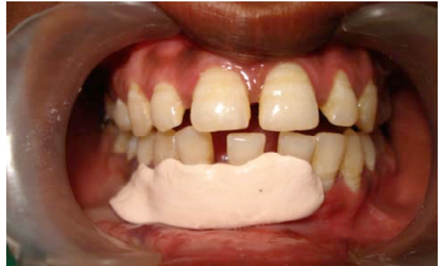
Fig. (6). Periodontal dressing.