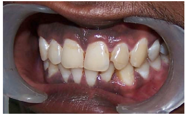
Fig. (11). Post-operative.

A 27 year-old male patient presented to the Faculty of Dental Sciences, BHU, Varanasi, with a chief complaint of a swelling on the gums at the lower front region of the jaw lasting 3 months (Fig. 9). On clinical examination, a localized gingival swelling of 2cm X 1cm in size with clear signs