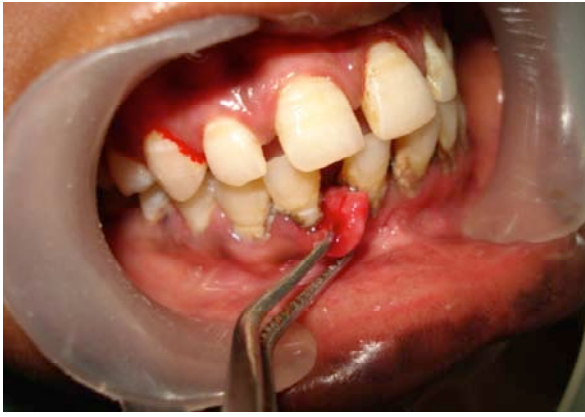
Fig. (2). Pre-operative (lateral view).