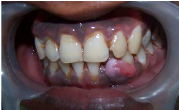
Fig. (9). Pre-operative.