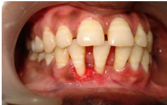
Fig. (4). After excision.

mobility was present in tooth 42. The patient's medical history was uneventful. The periapical radiograph showed a deep bony defect extending from 41 to 42 (Fig. 3).