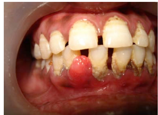
Fig. (1). Pre-operative.

Pyogenic granuloma is a hyperactive benign inflammatory lesion that occurs mostly on the mucosa of females with high levels of steroid hormones. It is generally believed that female sex hormones play important roles in its pathogenesis [3]. It is a tumourlike growth of the oral cavity (frequently located surrounding the anterior teeth) or skin that is considered to be neoplastic in nature [4]. It usually arises in response to various