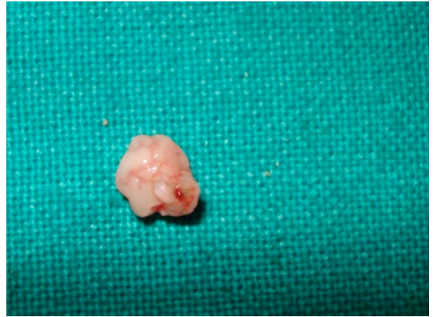
Fig. (5). Excised tissue.

So by considering all the above features a provisional diagnosis of pyogenic granuloma was made and excisional biopsy was planned. A conventional non-surgical therapy was first of all performed, with full mouth scaling and root planing. There was severe bleeding while doing scaling and curettage. However, the bleeding stopped within a few minutes by applying pressure with gauze. The patient was advised to perform and maintain their oral hygiene by brushing twice a day and to use a chlorhexidine mouth rinse of 0.2% twice daily. On observation, there was a gradual reduction in the growth after 2 weeks.