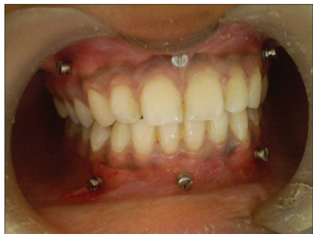
Figure 3: Intermaxillary fixation screws in position