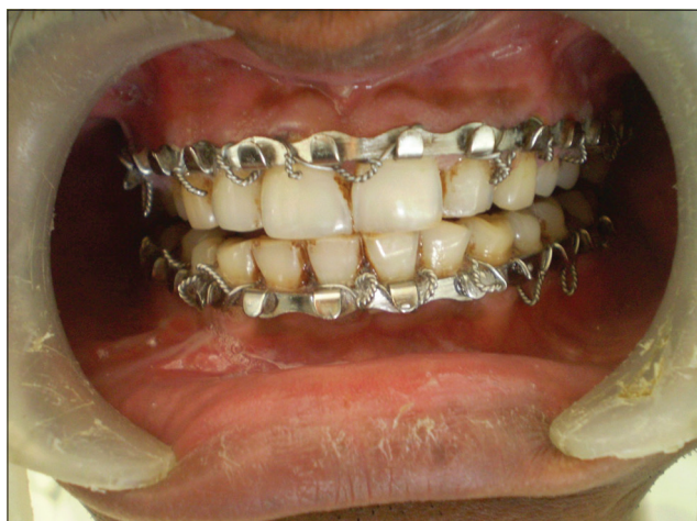
Figure 1: Arch bar fixation done

In our study, a comparison was made regarding the advantages and disadvantages of IMF screws over arch bars and also to record the incidence of complications with both techniques.