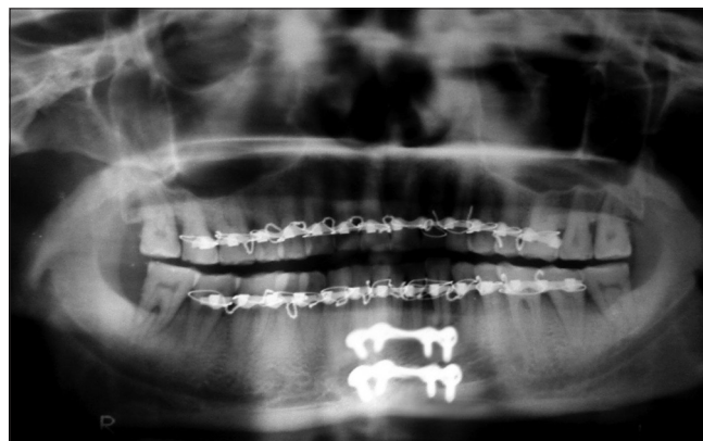
Figure 2: Open reduction and fixation done after arch bar fixation

The method used for the placement of Erich arch bar is as follows.