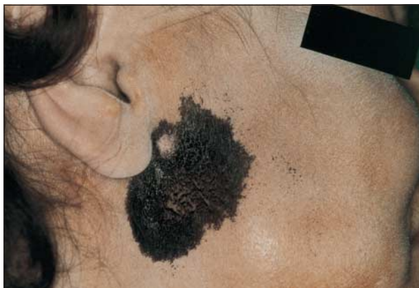
Figure 3. Positive Minor starch-iodine test result showing starch color change from white to dark purple.

system elevation of skin flap), 8-11 nonvascularized tissue (lyophilized dura, dermis fat grafts, fascia lata), and synthetic biomaterials (expanded polytetrafluoroethylene) have been used for this purpose. 12,13 These techniques all address the soft tissue defect associated with parotidectomy.