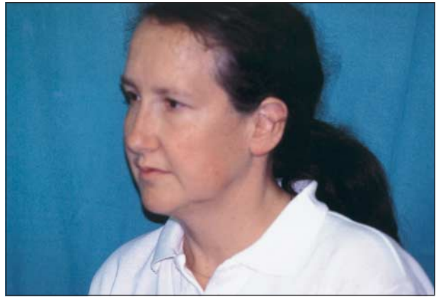
Figure 7. Same patient as in Figure 4, side not operated on (left oblique view).