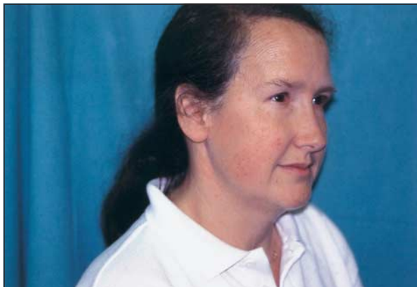
Figure 6. Same patient as in Figure 4, side operated on (right oblique view).

lique views demonstrate restoration of good soft tissue contour at the surgical site ( Figures 4, 5, 6, and 7 ).