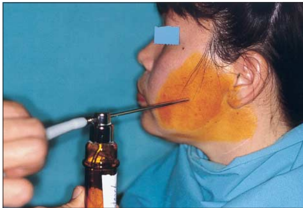
Figure 2. Minor starch-iodine test. The parotid area is painted with iodine and sprayed with starch powder.