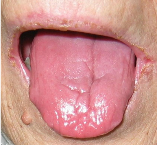
Fig 1 Depigilated red tongue and angular cheilitis