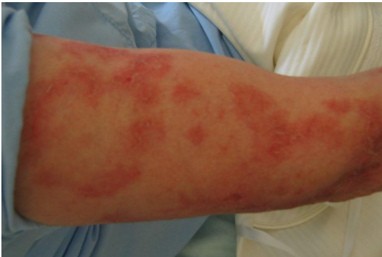
Fig 2 Annular erythema associated with Sjögren syndrome (also called Ro associated cutaneous lesions or subacute lupus-like lesions)