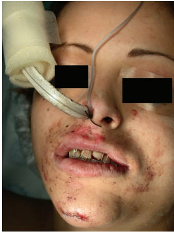
FIGURE 2: A patient with maxillofacial trauma ventilated through a nasal endotracheal tube.

At this point, a decision needs to be made on the type of airway control which is suitable for the intended surgery. Some patients arrive to the operating room conscious and spontaneously breathing and their maxillofacial trauma is not extensive. In selected patients, nasoendotracheal intubation can be used for airway control during surgery [58] (Figure 2). However, nasoendotracheal intubation is relatively contraindicated in patients with midface fractures or fractures at the base of the skull [59].