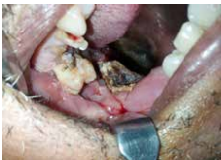
Figure 5. Case 2: A dark cauliflower-like growth appearing as necrotic bone in the retromolar trigone.