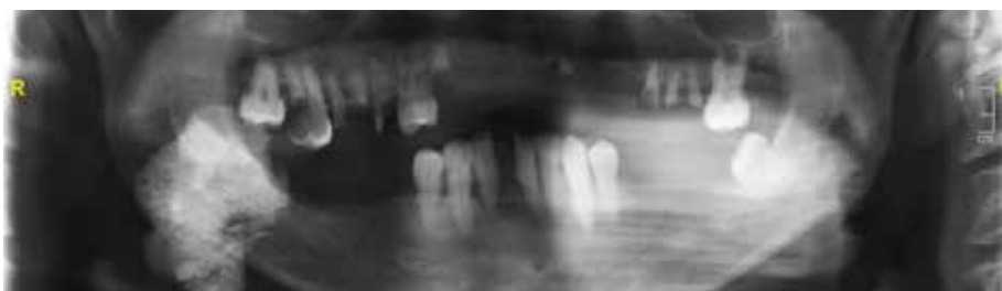
Figure 6. Case 2: Orthopantomogram (OPG) showing giant nodular radio-opacity near right angle of mandible.

lymph nodes, tuberculosis of salivary gland, myositis ossificans, or metastasis from distinct calcifying neoplasms. In Case 2, the patient was initially misdiagnosed as a submandibular tumour by the otolaryngology department. But, after thorough investigation by an oral and maxillofacial surgeon, final and correct diagnosis was established, ie a submandibular sialolith. This reflects that the role of dentist