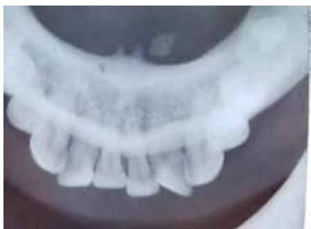
Figure 2. Case 1: A lower occlusal radiograph showed a nodular radio-opacity at the left lingual aspect of anterior mandible.

intra-oral examination, a crenated tongue on the left and right lateral border was noticed. On bi-digital palpation, a calcified mass was felt immediately adjacent to the left side of the lingual frenum (Figure 1). No other abnormality was detected and oral hygiene, as well as dental condition, was fair. A lower occlusal radiograph showed a nodular radio-opacity measuring roughly 1.5 mm × 4 mm at the left lingual aspect of the anterior mandible (Figure 2).