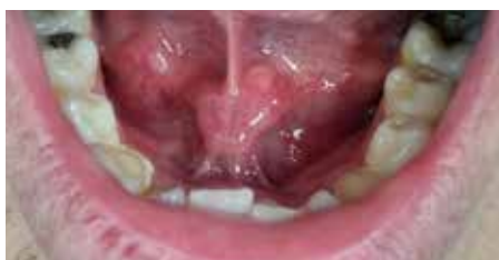
Figure 1. Case 1: A calcified mass immediately adjacent to the lingual frenum on the left side.