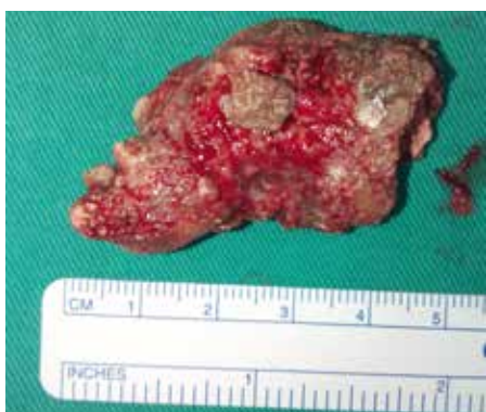
Figure 8. Case 2: Giant submandibular sialolith (megalith) after the removal measuring 4.61 cm x 2.53 cm.

lymph nodes, tuberculosis of salivary gland, myositis ossificans, or metastasis from distinct calcifying neoplasms. In Case 2, the patient was initially misdiagnosed as a submandibular tumour by the otolaryngology department. But, after thorough investigation by an oral and maxillofacial surgeon, final and correct diagnosis was established, ie a submandibular sialolith. This reflects that the role of dentist