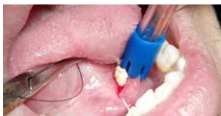
Figure 3. Case 1: Submandibular sialolith being removed.

The diagnosis of a left submandibular sialolith was established and the patient was scheduled for removal of the sialolith. On the day of the appointment, written consent was taken after explaining the possible complications, which included bleeding, ductal injury, infection and recurrence. Local anaesthesia (2% mepivacaine with adrenaline) was infiltrated and a Bowman Lacrimal Probe (size 3) was used to access and protect the Wharton's duct. A stay suture was placed around the proximal end of the probe using 3/0 silk. The sialolith was palpated and a superficial incision was made over the sialolith using a BP blade no. 15, followed by blunt dissection, and the sialolith was removed (Figures 3 and 4). The silk suture was removed, and patency of the duct was examined, which appeared to be normal. The extracted sialolith measured 4 mm in length and 1.5 mm in width. Post-operative