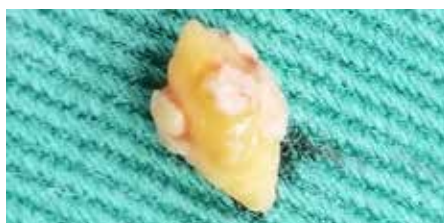
Figure 4. Case 1: Extracted submandibular sialolith measuring 1.5 mm × 4 mm.

instructions were given to the patient. The patient was advised to consume citrus drinks to stimulate salivary flow. Chlorhexidine (0.2%) 15 ml bid 2/52 and Tab Paracetamol 1000 mg PRN 3/7 were prescribed.