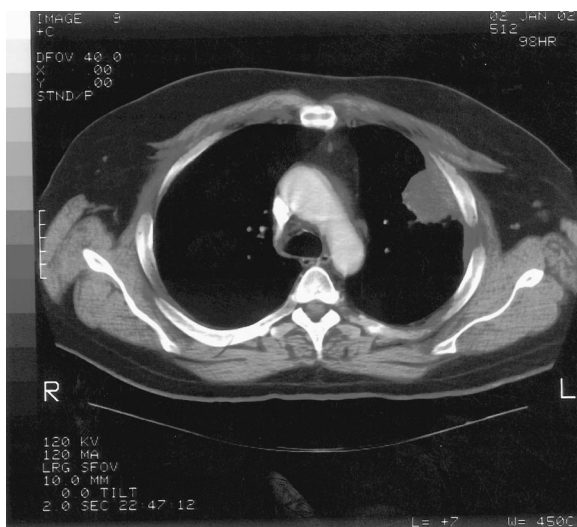
Figure 2. Coronal CT of sinuses demonstrating bilateral ethmoid and maxillary sinus disease.

On day 3, the patient complained of joint pain, mainly in the right shoulder and both hands. The patient's erythrocyte sedimentation rate and C-reactive protein level were elevated. His rheumatoid factor level was 566 IU/mL, and tests for antinuclear antibodies were negative. He was started on indomethacin and his symptoms improved in 2 days. CT-guided biopsy of the lung showed acute and chronic interstitial inflammation suggestive of a granulomatous process (Fig. 4). The patient was put in respiratory isolation until the results of 3 sets of cultures for mycobacteria came