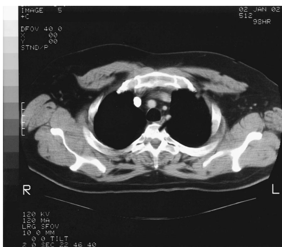
Figure 3. Chest CT demonstrating soft tissue mass in left upper lobe abutting the pleura.

On day 3, the patient complained of joint pain, mainly in the right shoulder and both hands. The patient's erythrocyte sedimentation rate and C-reactive protein level were elevated. His rheumatoid factor level was 566 IU/mL, and tests for antinuclear antibodies were negative. He was started on indomethacin and his symptoms improved in 2 days. CT-guided biopsy of the lung showed acute and chronic interstitial inflammation suggestive of a granulomatous process (Fig. 4). The patient was put in respiratory isolation until the results of 3 sets of cultures for mycobacteria came